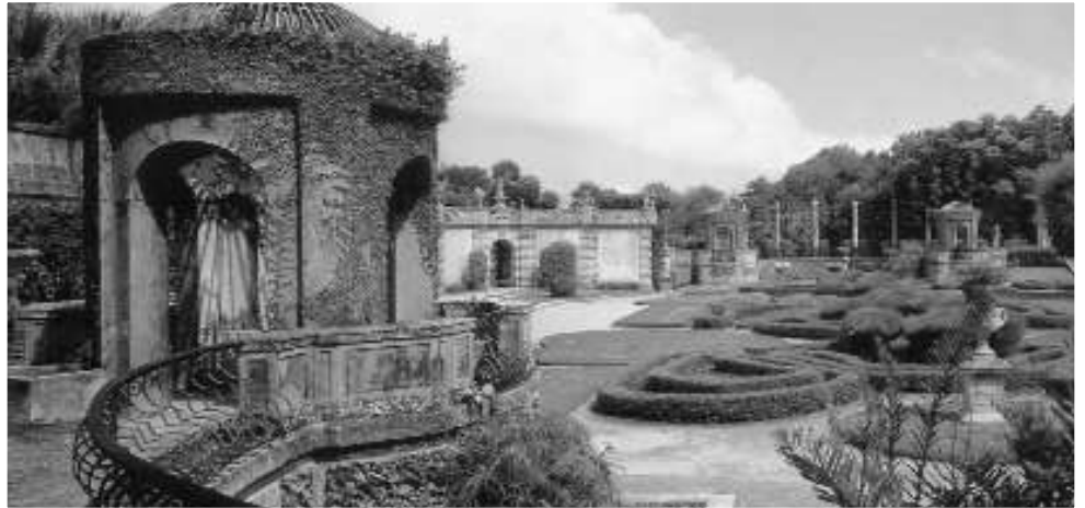
Gardens at Vizcaya