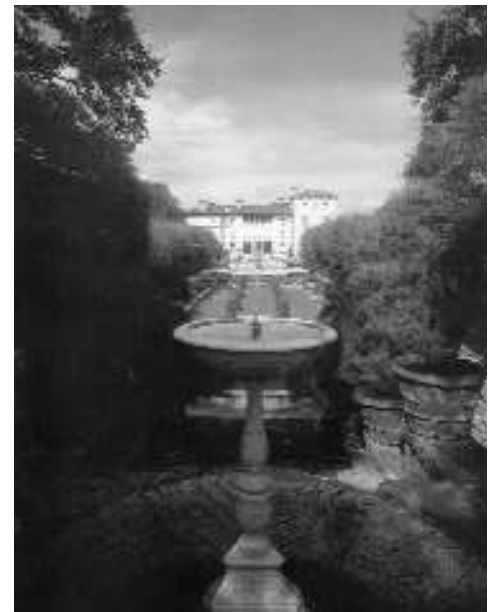
The central axis of the garden at Vizcaya with 16th-century marble fountain

Students may also economize by volunteering to assist in conference administration. Those who work for eight to ten hours at the registration tables and/or special events will receive a waiver of the meeting registration fee. Although many of these positions are reserved for graduate students at the meeting's host institutions, others will be awarded on a first-come, first-recruited basis. Those interested should notify the SAA offices.