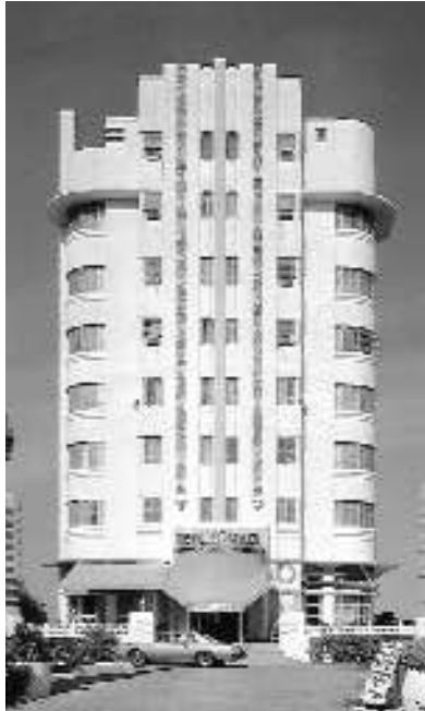
Above, The New Yorker Hotel in the heart of the Art Deco District

CORAL GABLES has a concentration of the best restaurants in Miami and is an affordable taxi ride from downtown if 4-5 people share. One of America’s first planned communities, Coral Gables is a fascinating